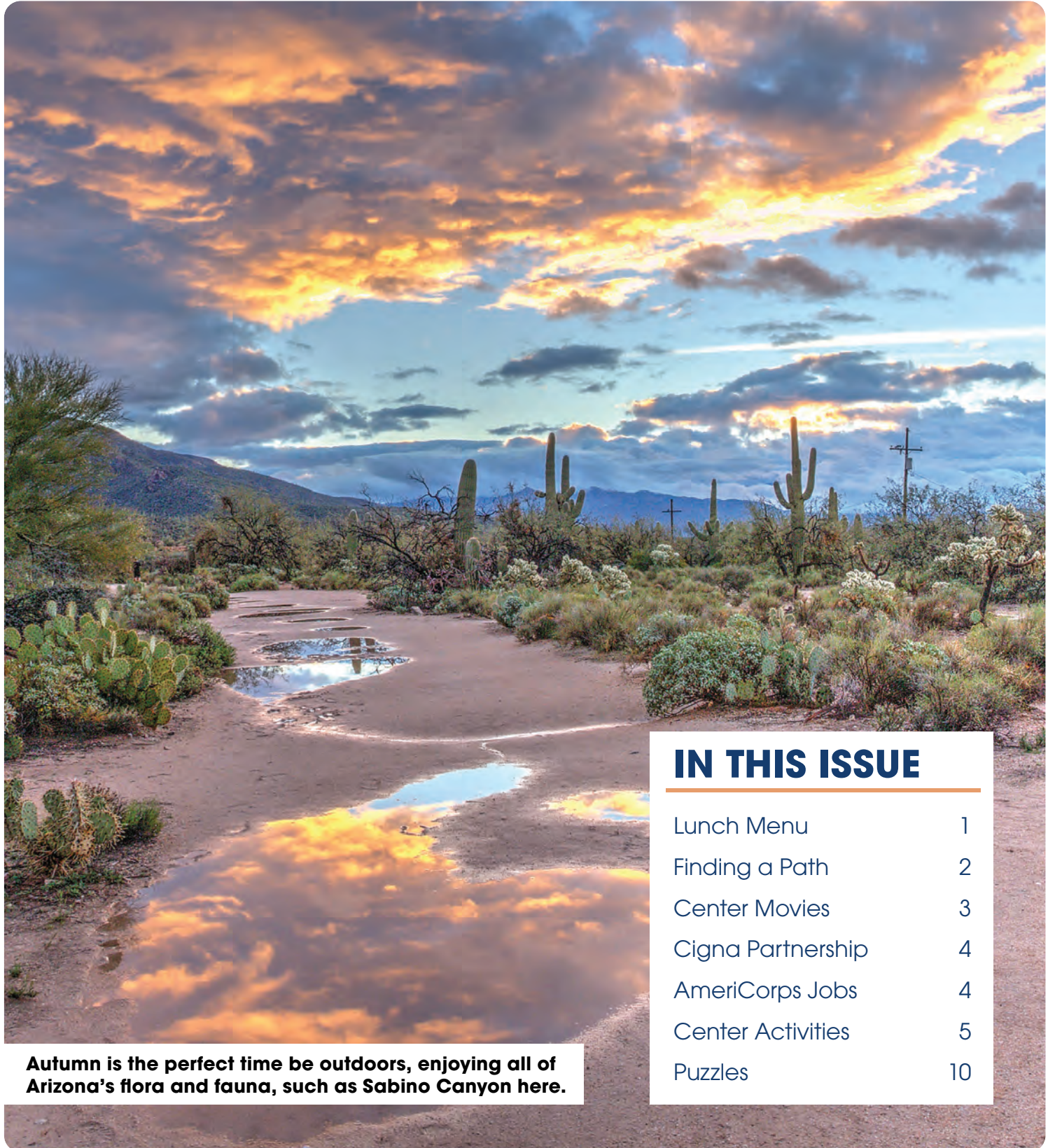
Autumn is the perfect time be outdoors, enjoying all of Arizona's flora and fauna, such as Sabino Canyon here.