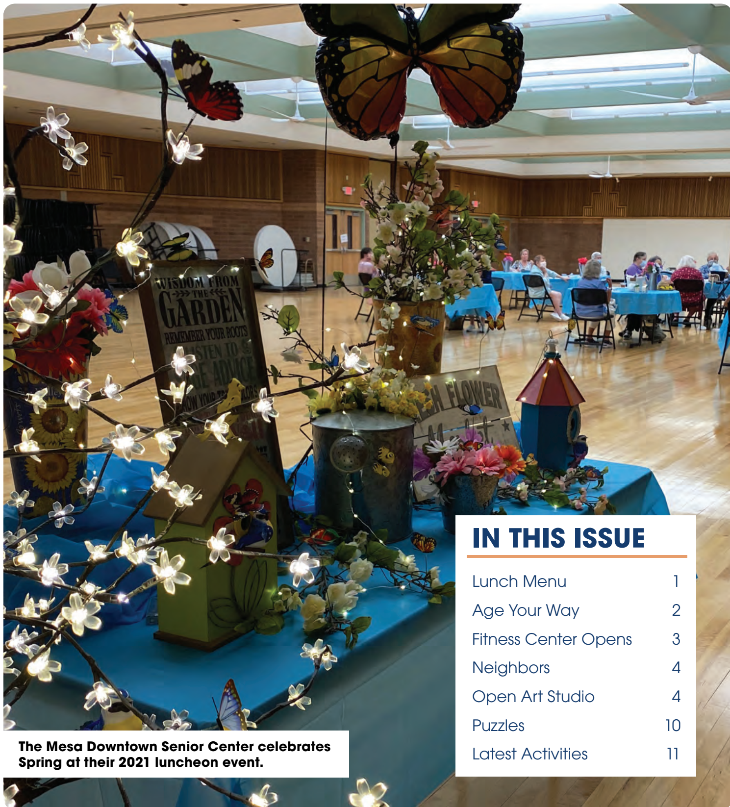
The Mesa Downtown Senior Center celebrates Spring at their 2021 luncheon event.